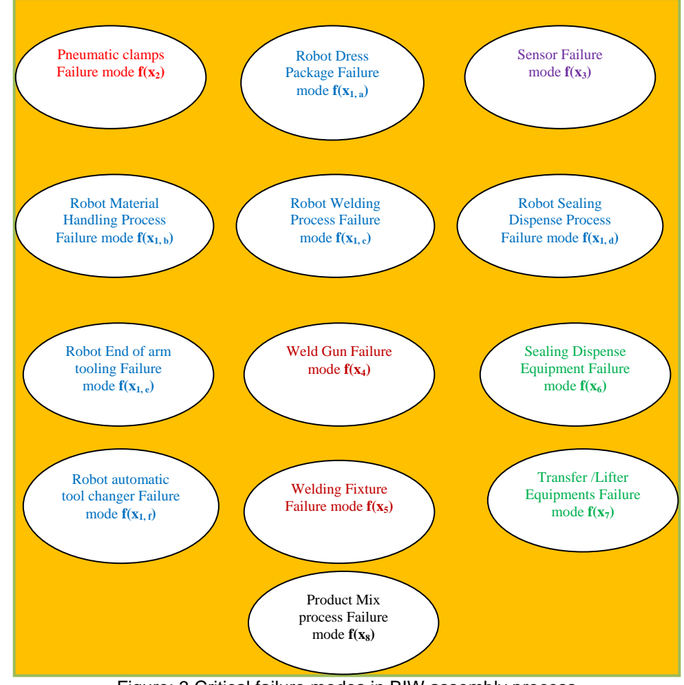
Figure: 3 Critical failure modes in BIW assembly process